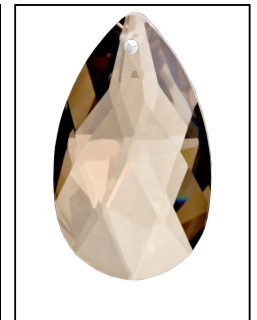
Golden Teak Swarovski®