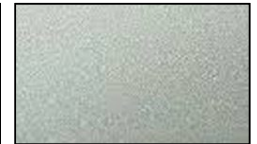
Sand Blasted Clear