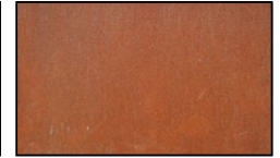
Heavy Textured Rust