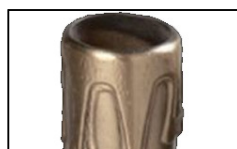
Cast Brass Drip