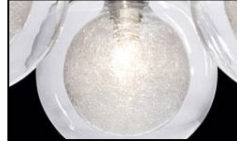
Confetti & Clear