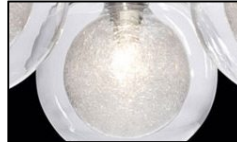
Confetti & Clear