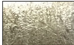
Antique Silver Leaf