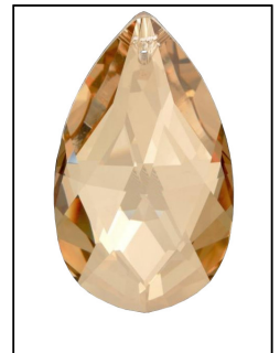
Gold Shadow Royal Cut