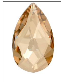
Gold Shadow Swarovski®