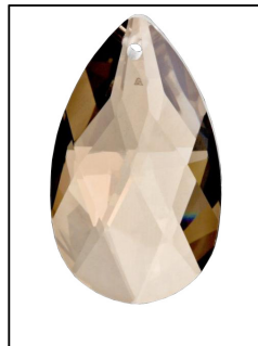
Golden Teak Swarovski®