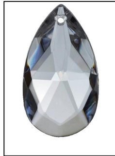
Clear Elegant Cut