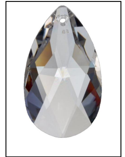
Clear Swarovski® Spectra