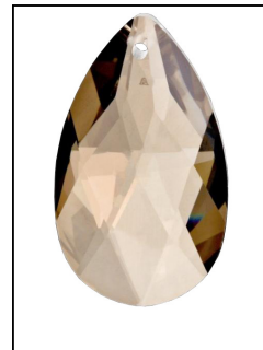
Golden Teak Royal Cut