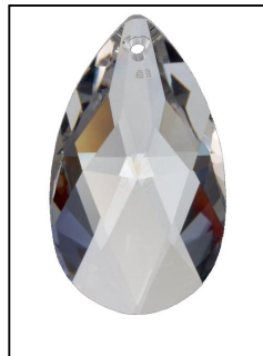
Clear Swarovski® Strass