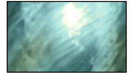
Desert Sky Blue