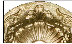
Brass w/Black Inlay