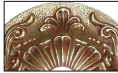
Brass w/Umber Inlay