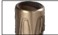
Cast Brass Drip