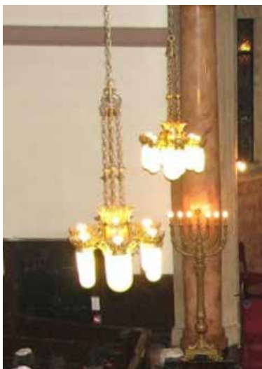
(Typical Pre-Restoration Photograph)