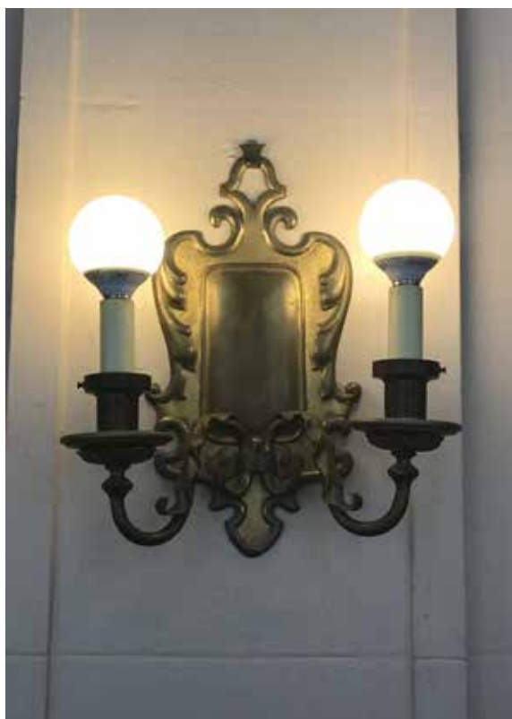
(Typical Pre-Restoration Photograph)