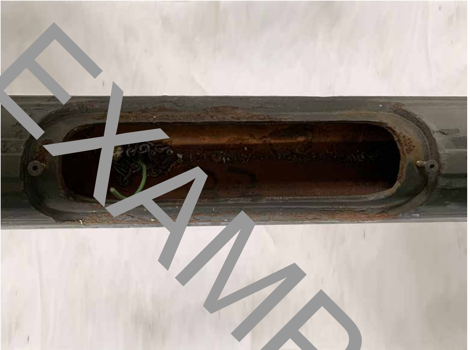
(Missing Access Panel)