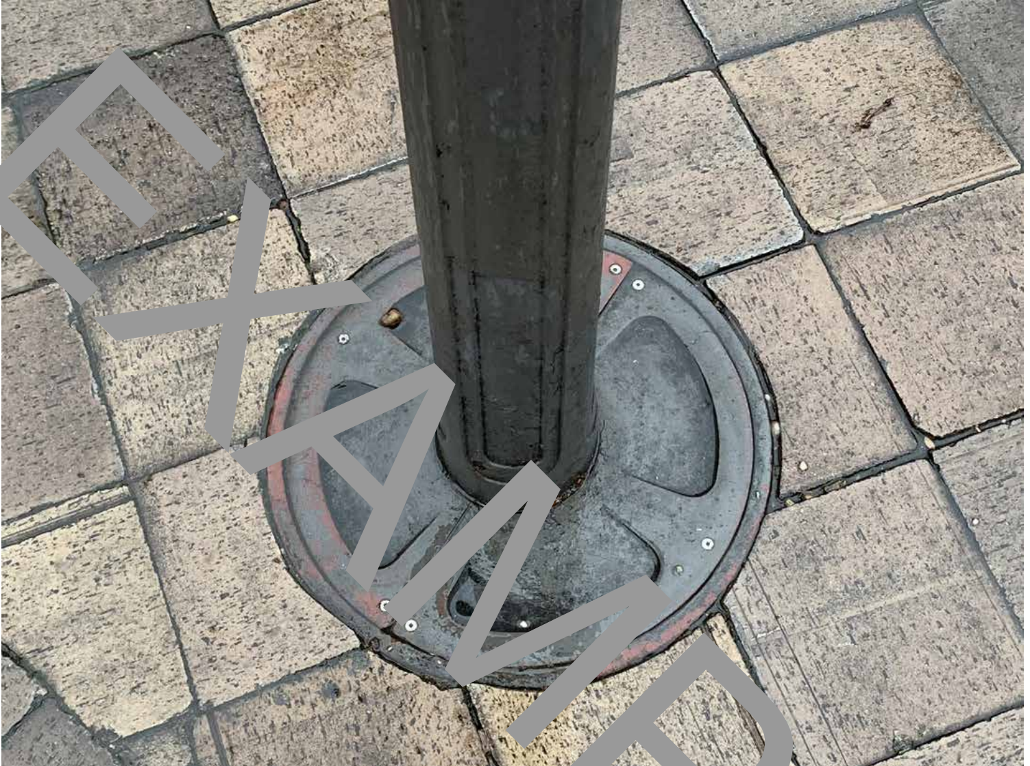
(Missing Base Cover)