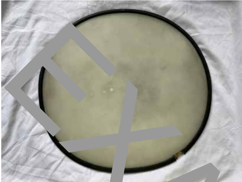
(Opal Acrylic Diffuser)