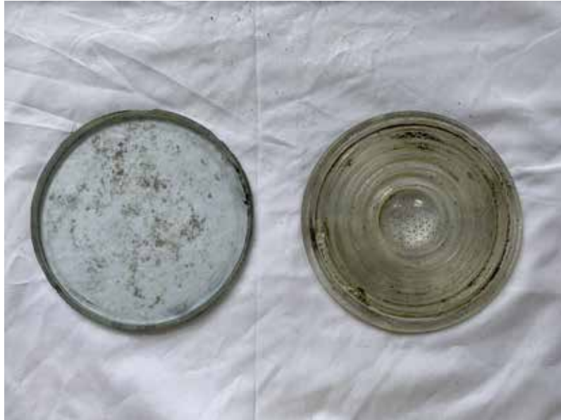
(Top Clear Glass Diffuser)